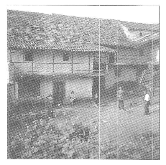
Figure 1. Typical Karst homestead belonging to the Grmek family in the village of Kobjeglava, as photographed in the year 1940

agriculture, was no longer functional. Livelihoods were earned not from farming but from industry, and this led to the abandonment of cultivation of the land and changes in the functions of houses. Two contradictory processes began to take shape: on the one hand, the abandonment of agriculture, and on the other hand the growth of building activity. Moreover, under the new political ideology of socialism, the preservation of traditional peasant culture came to symbolize poverty and backwardness. The new socialist ideology, as part of the construction of a new Yugoslav identity in the spirit of "brotherhood," suppressed the expression of unique identifying characteristics in local architecture.