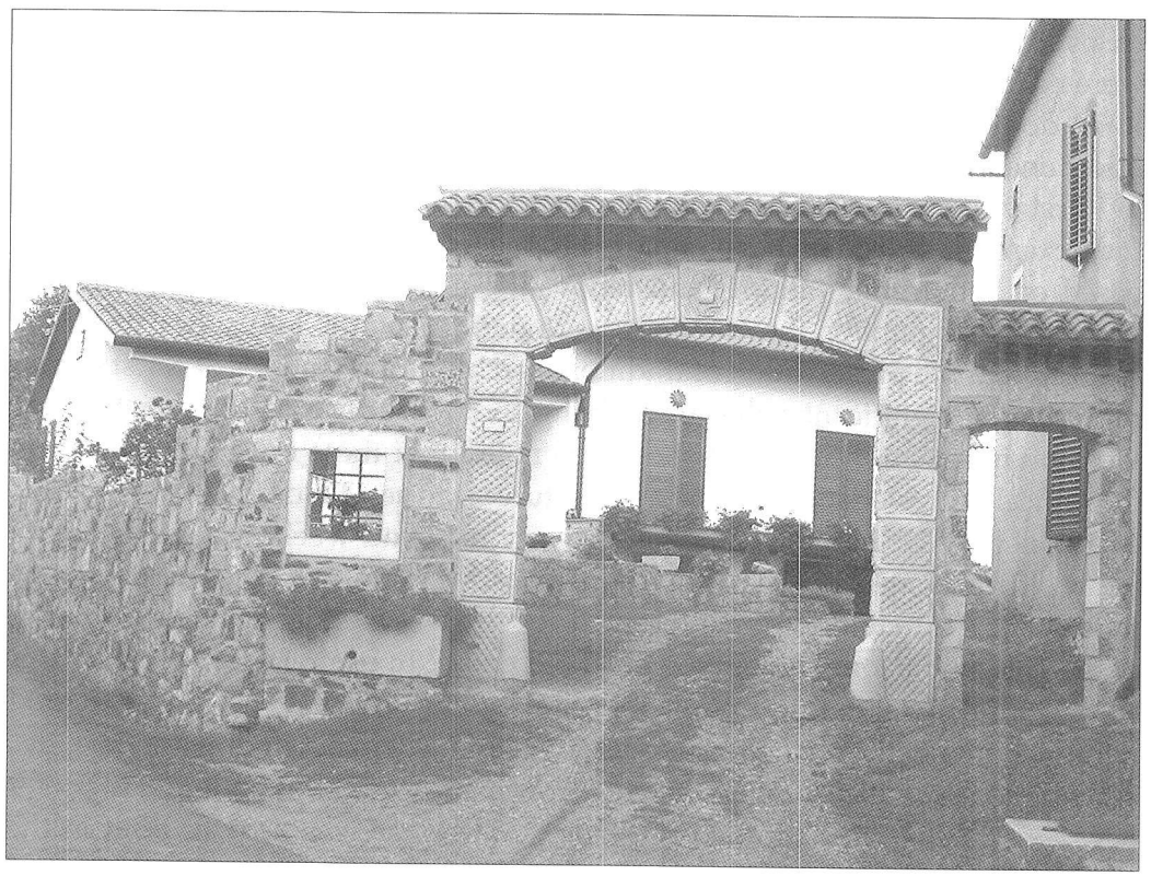
Figure 3. Recently constructed house with old, traditional entrances to courtyard, built after Slovenia's independence. The house is located in the Karst village called Škrbina. (Foto: Jasna Fakin Bajec, September 2004)

past certain architectural features of Karst houses (for example, the portal entrance to and high walls surrounding the courtyard) expressed a certain function – for example, shielding the house from harsh climatic and geographical conditions (the burja and very hot summers) as well as protecting personal property, particularly water). And local residents of the Karst also interpreted these things in light of their primary function. Today, due to new architectural trends, modern technology, and architectural development they no longer perform this function but nevertheless represent an aesthetic element, and an identifying symbol of the Karst, in new construction. Usually, the form of these symbols (such as the shape of the portal with its "kaluna" stone arch and "portun" wooden gates leading into the courtyard) has been preserved among the members of a community, but it does not have a common, unified meaning.